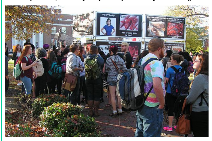
On Day 2, the sun comes out and the storm rages.

Gloating for Jesus. On that rainy Day 1, a young Christian student gloated, "You all came to start a fire on campus, but look. It's raining. Where's your fire now?"