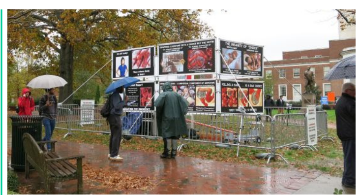
On Day 1, the rain deters the stormtroopers. But they see the pictures, and they keep their powder dry ... waiting.

The shouting, jeering crowd was perhaps wearisome at times, but their 5-hour exposure to the GAP display was a huge victory. If 3 seconds gets the point across, who knows what 5 hours can do?