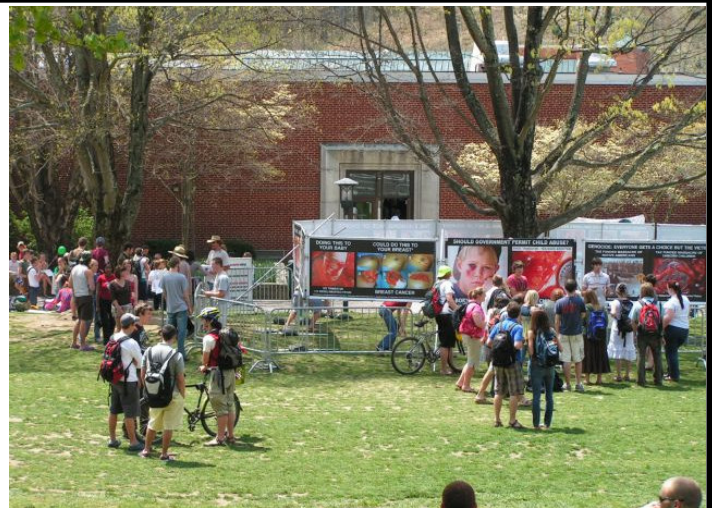
Many discussion groups form around the perimeter of the GAP display.

Please support our work on a monthly basis. Remember, another baby's life is at stake. Thank you!