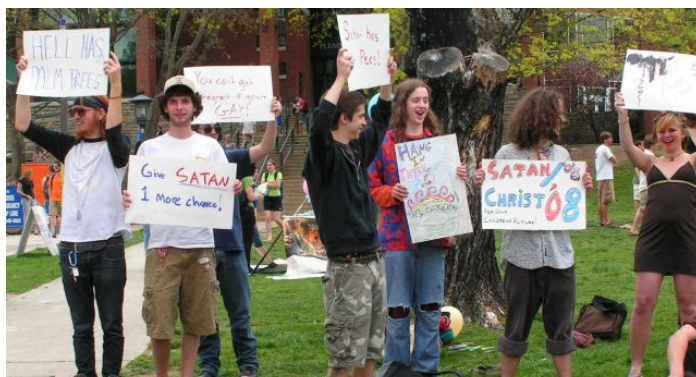
They have no arguments and they aren't allowed to use force, so these pro-aborts resorted to absurdism. One of the signs: "Hell has palm trees." Another: "Satan has great pecks!"