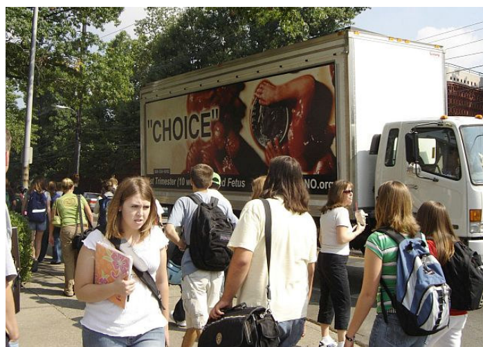
Combining RCC with GAP is an excellent way to make abortion THE topic of conversation on campus. The more they see and the more they think, the more we like it!