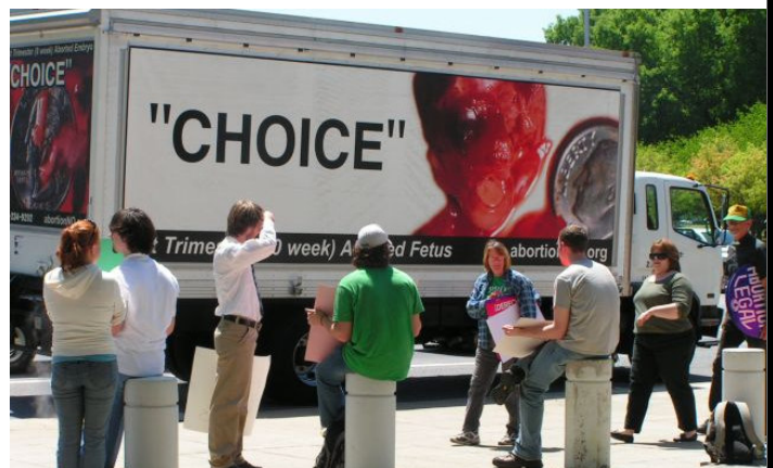
The RCC Truck gets up-close and personal with this group of hard-core pro-aborts.