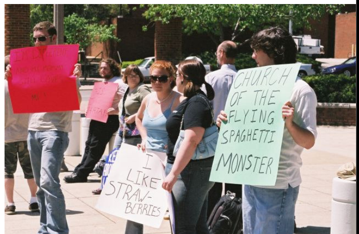
Pro-aborts can’t win arguments, so they often resort to absurdity. The signs in this picture say, from left to right: “I’m different, and my mommy still loves me” “I like strawberries.” “Church of the flying spaghetti monster”